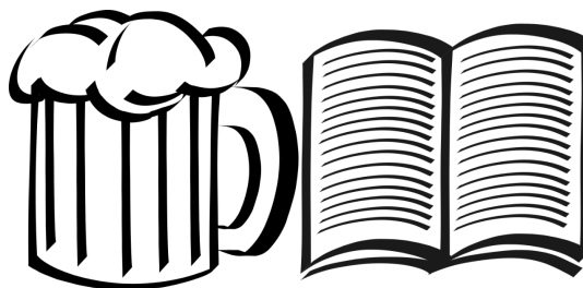
Figure 2: The icons displayed on landmarks that identify its resource type: Beer (left) or Knowledge (right)

Landmarks - A landmark is a special kind of sector. If a player owns a landmark, a new unit will spawn at the landmark at the start of the player's turn, assuming there is not a unit already on the landmark. In addition, each landmark is associated with a specific type of resource (Fig. 2), and the player who owns the landmark also owns 2 of the landmark's associated resource.